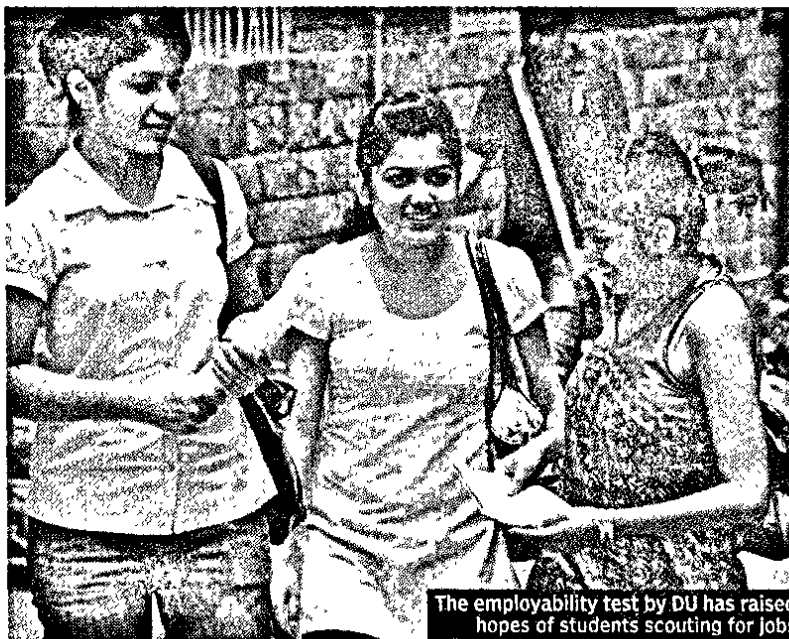
The employability test by DU has raised hopes of students scouting for jobs

Some students who are eagerly waiting for the results, don't want the companies to gauge them solely by their test scores. “The only drawback is that now the students have only one chance to prove their mettle as all the companies that come thereafter will rely only on the test scores before selecting students. Sometimes one isn't at one's best on the day of the exam. So I don't think com-